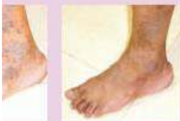
ment After treatment